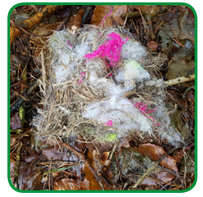
Anyone for tennis!