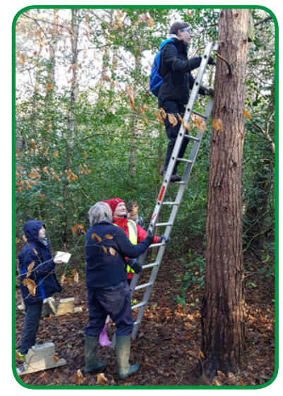
Pannal Scouts lend a hand.

Like the Pinewoods the nesting materials were interesting - a bottom layer of fine moss, overlaid with shredded reedmace leaves and tastefully framed with red tennis ball fluff.