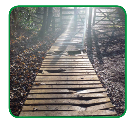
The vandalised path...

The new surface stood throughout last year before the vandals decided to attack it and break it up. However, undeterred we had a small team recently repairing and strengthening it to make it more robust.