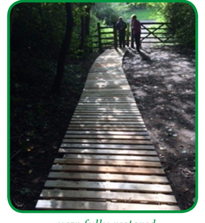
...now fully restored.