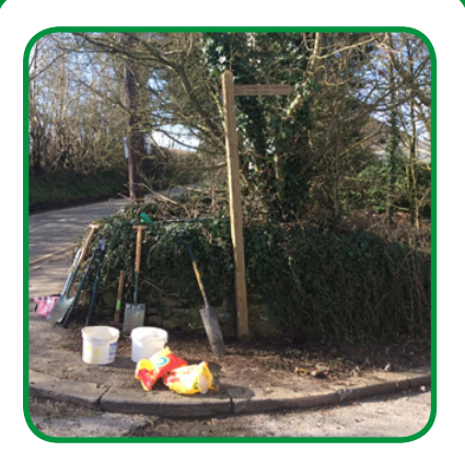
No horsepower just muscle, skill and spades.